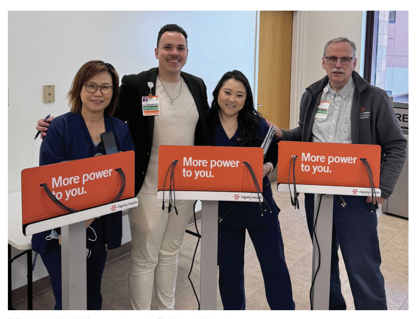
California Hospital Medical Center caregivers and staff with the mobile charging carts.