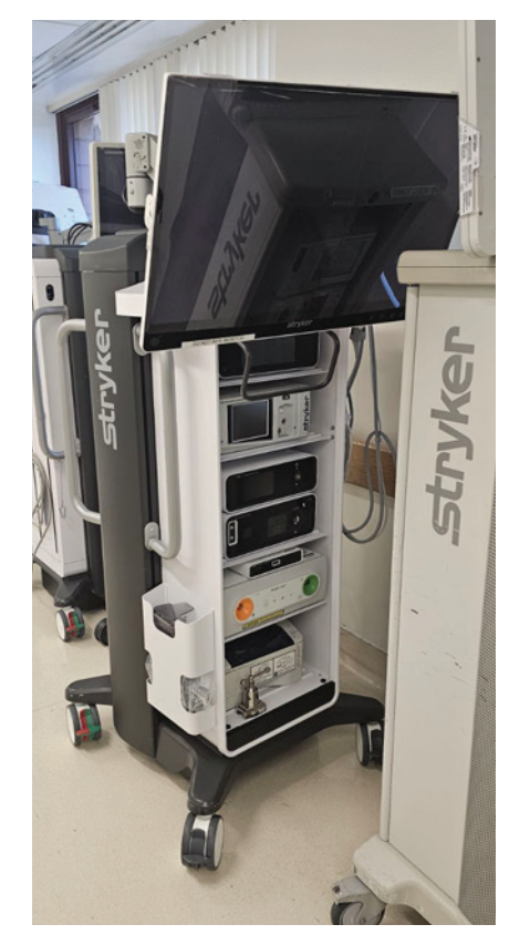
The Stryker 1788 Platform.